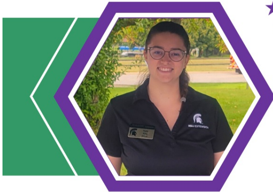
MICHIGAN STATE UNIVERSITY | Extension